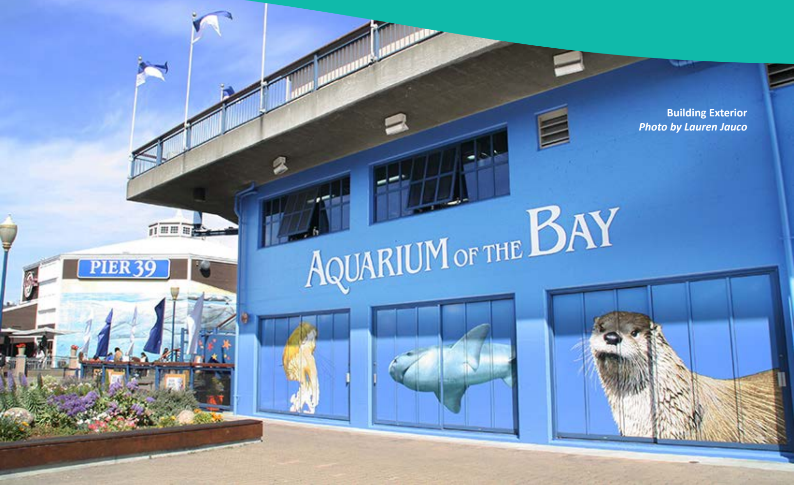
Building Exterior