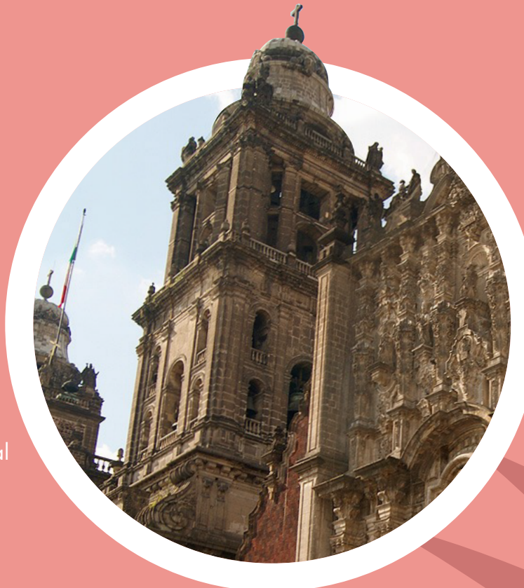
The Metropolitan Cathedral in Mexico City is the first cathedral to be built in the Americas.