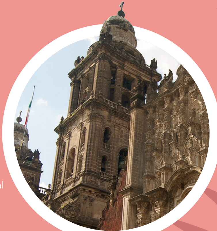
The Metropolitan Cathedral in Mexico City is the first cathedral to be built in the Americas.

Farewell Breakfast and presentation by UNESCO representative in Mexico City. Adios! Until we meet again. Amigos!